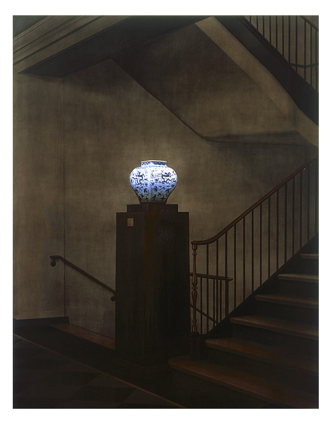
Fig. 3 David Klamen, Untitled (Vase), 1993.