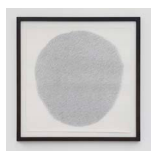
MCARTHUR BINION (b. 1946) Under:Conscious: Drawing IV, 2014 Colored pencil on paper 52 ½ × 52 ½ inches 133.4 × 133.4 cm 1119039

1018 Madison Ave, 4th Fl New York, NY 10075 +1 212 472 8787