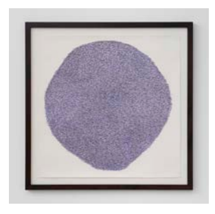
MCARTHUR BINION (b. 1946) Under:Conscious: Drawing VII, 2014 Colored pencil on paper 52 ½ × 52 ½ inches 133.4 × 133.4 cm 1119042