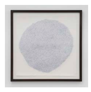
MCARTHUR BINION (b. 1946) Under:Conscious: Drawing III, 2014 Ballpoint pen on paper 52 ½ × 52 ½ inches 133.4 × 133.4 cm 1119038