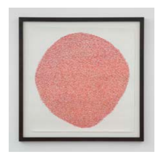
MCARTHUR BINION (b. 1946) Under:Conscious: Drawing VI, 2014 Colored pencil on paper 52 ½ × 52 ½ inches 133.4 × 133.4 cm 1119041