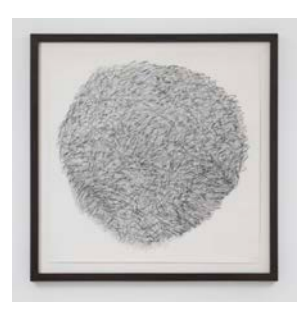
MCARTHUR BINION (b. 1946) Under:Conscious: Drawing II, 2014 Charcoal on paper 52 ½ × 52 ½ inches 133.4 × 133.4 cm 1119037

1018 Madison Ave, 4th Fl New York, NY 10075 +1 212 472 8787