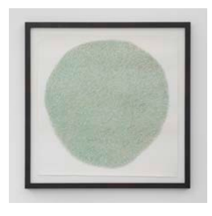
MCARTHUR BINION (b. 1946) Under:Conscious: Drawing V, 2014 Colored pencil on paper 52 ½ × 52 ½ inches 133.4 × 133.4 cm 1119040