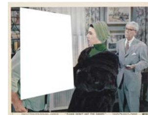
Top to Bottom: Ellen Lanyon, Untitled , 1964, pastel on paper, 26 3/8 x 19 inches; John Storrs, Untitled , 1917, ink on paper, 5 1/4 x 4 1/8 inches; John Stezaker, Tabula Rasa XIII , 2006, collage, 8 x 10 inches.