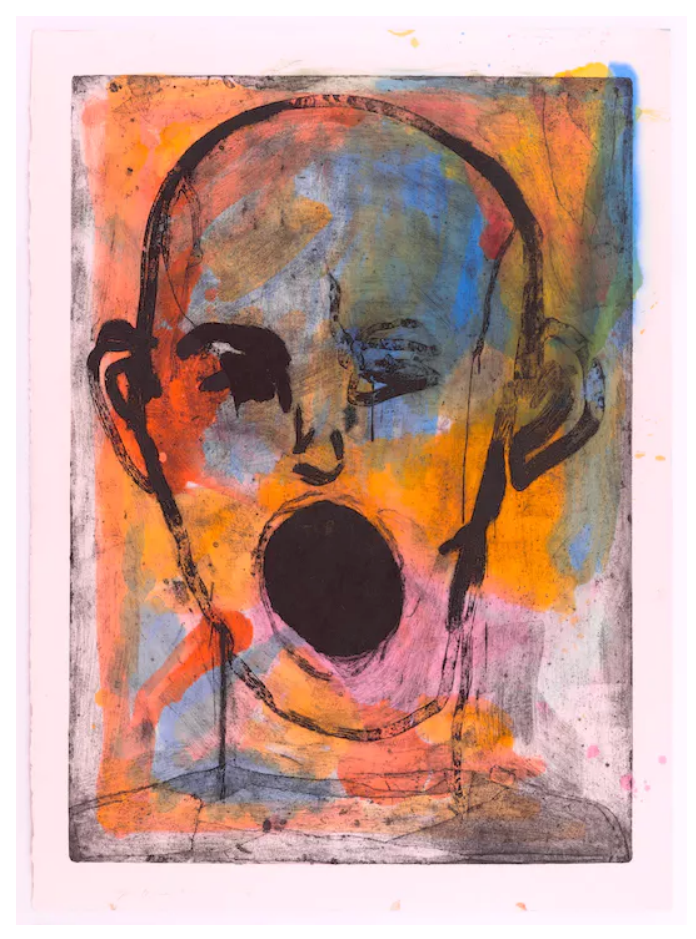
Poet Singing Beautifully (2016), Jim Dine. Courtesy the artist and Alan Cristea Gallery, London

The subtitle of the British Museum show, 'From Pop to the Present', is a loose signpost intended to give the general public some sense of what might be displayed. But Dine, as he rapidly makes clear, is not and has never been a Pop artist. 'I never felt