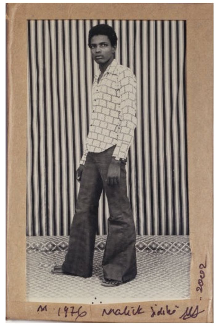
Malick Sidibé/Jack Shainman Gallery, New York

In Mr. Hammons's design, elements of the black-liberation flag are combined with the flag of the United States, but neither completely subsumes the other. Instead the two coexist — suggesting that being black and American contains a persistent, perhaps irreconcilable, tension.