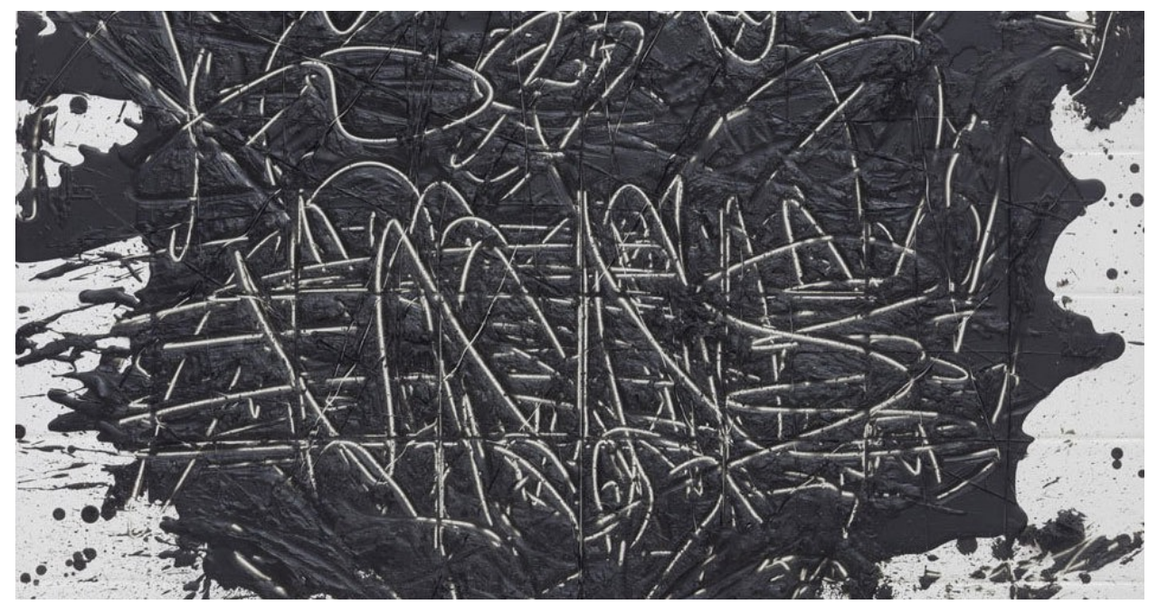
Detail of one of Mr. Johnson's untitled pieces from "Anxious Men."

Mr. Johnson smears and scratches his mixture of black soap and wax, allowing it to cake, clump and splatter. Against the backdrop of sterile, white tiles, it is sometimes hard to look at, like something has been exposed and not meant to be seen.